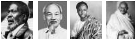
Left to right: Jomo Kenyatta, Ho Chi Minh, Kwame Nkrumah, Mahatma Gandhi