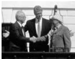
Yasser Arafat, founder of the PLO, and Yitzhak Rabin, Israel's prime minister, shake hands after signing the Oslo Accords in 1994